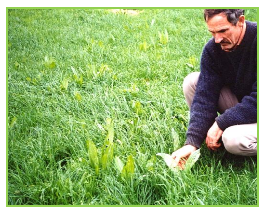
Figure 1: Tonic plantain sown with Endosafe ryegrass and clovers

• In its leafy state plantain is a palatable herb with very good acceptability to a number of ruminant species including deer, sheep and cattle.