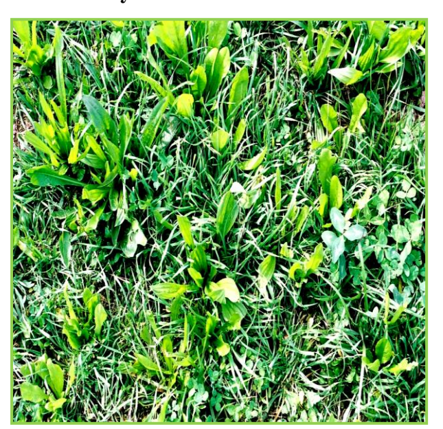
Figure 3: Deer finishing pasture (Tonic plantain, Advance tall fescue, Gala grazing brome, red and white clover)