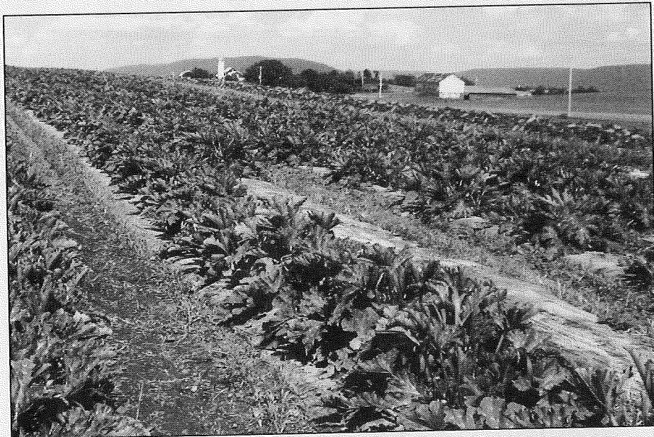
AEA's system combines advanced drip irrigation, foliar feeding, bio-fortification of soil with microbes, micronized inputs and more to provide optimal nutrition for crops.