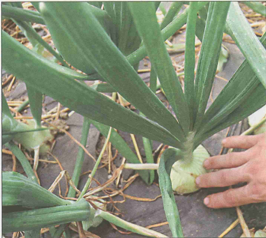
The AEA systems approach to plant nutrition results in hardy, nutrition-packed foods, such as this lush onion crop.

Humic substances complex with anions in the rhizosphere. Once complexed, more of the anions, especially phosphorus, remain in the soil solution layer between microbes and minerals rather than leaching away. In this root zone the chemical reactions are governed entirely by microbe interactions,